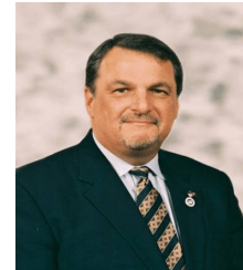
STATE SENATOR BUTCH GAUTREAUX