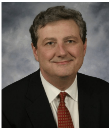
STATE TREASURER JOHN N. KENNEDY